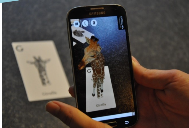
Octagon Studio 4D+ Playing Cards are used to teach the alphabet