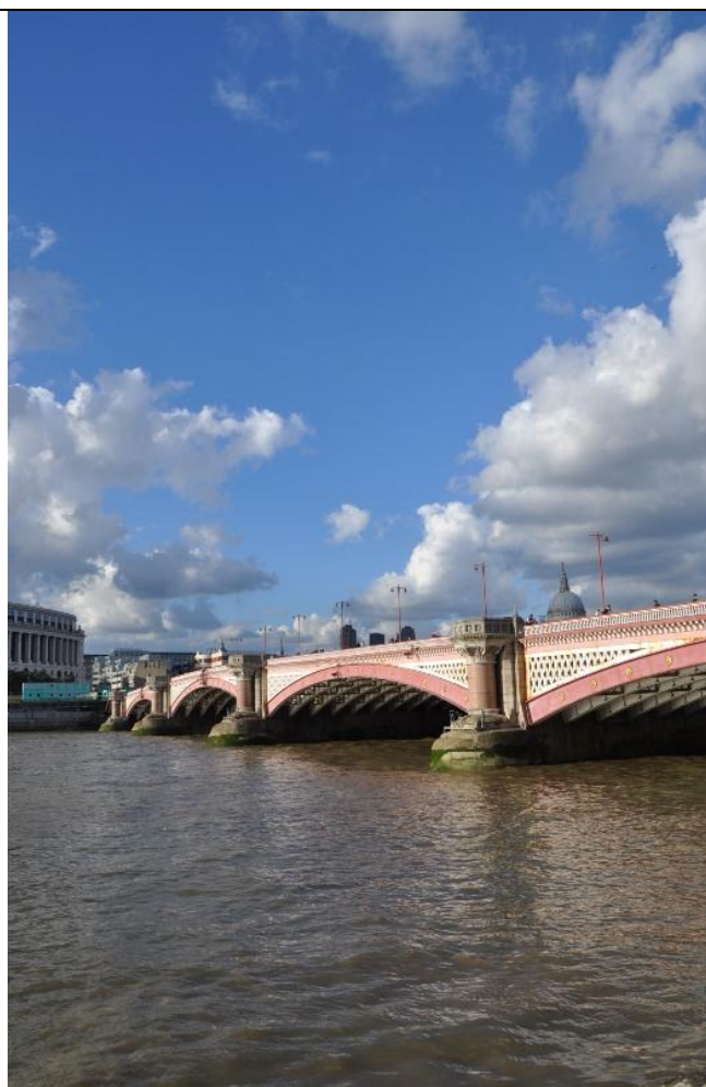
Bridges in London

The project follows the goal to broaden the adult learning offer easy-to-understand materials for trainers and learners in the field of European Union and Brexit.